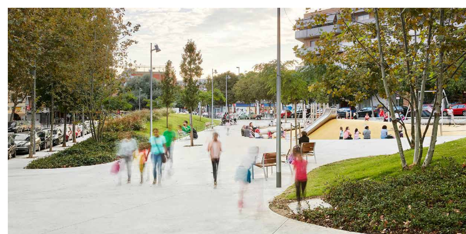
Open sight lines