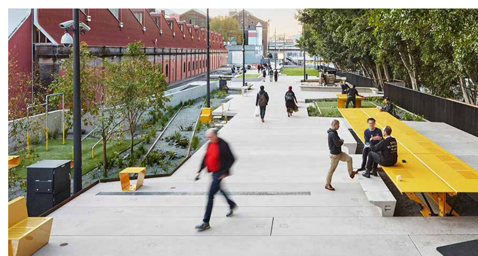
A variety of spaces and furnishings