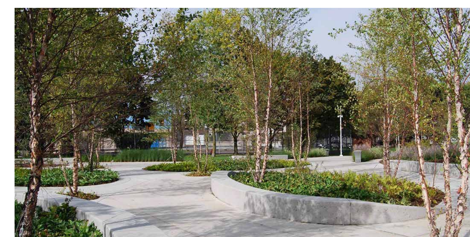
Designed for longevity - simple materials